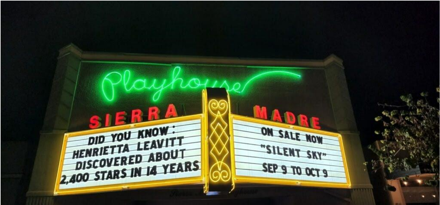
Pictured: Sierra Madre Playhouse